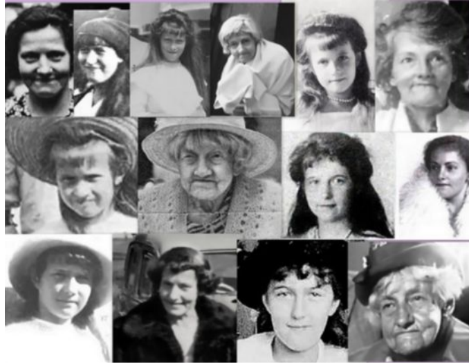
Anna Anderson, a.k.a. Anastasia

Impersonation and identity theft. Imposters Frank Abagnale and Frank Demara. Acting. Pretending to be someone you are not. Often claimants to a throne said to be illegitimately occupied are pretenders. Fake identities now resolved by DNA testing. Identity theft a major crime. Hoaxes can be illegal. Computer hacking. ID has unique fingerprints (friction ridge formation), face, gait, voice, handwriting, and DNA (from blood, skin, bones, hair, saliva, semen).