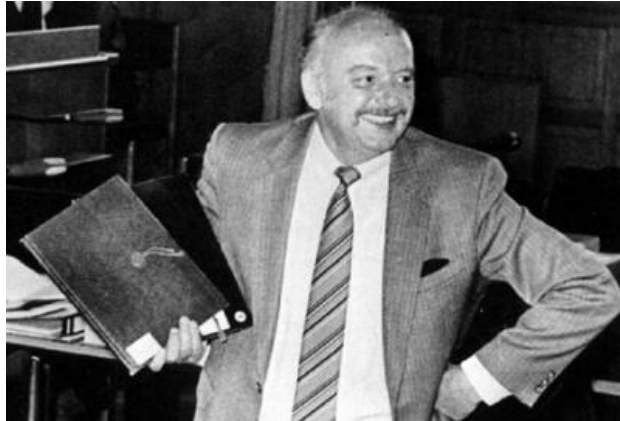
Konrad Kujau and a volume of his "Hitler Diaries."

Copying an authentic document or art work is not forgery. False claims of authorship create Forgery by signing a document or painting with another's name. Also, fiction disguised as nonfiction. Counterfeiting the authentic. Plagiarism as literary theft. Forgery as deception and creation. Misattribution.