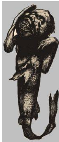
P.T. Barnum's Fiji Mermaid (1842)

Hoaxers: Nostradamus predictions. Wizard of Oz. Harold Hill in the "Music Man." Paul Newman in The Sting . Dr. Armand Hammer's wheelchair. Con artists as psychopaths, narcissists and Machiavellians. The grifter and the mark.