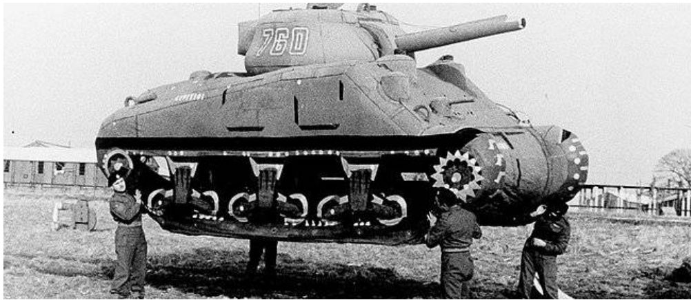
Dummy rubber tank of WWII.

Making the enemy think you are going to be when and where you are not. False weapons. Marching troops in a circle. Quaker Guns in the Civil War. Dropped false plans. Agents and turned agents of espionage. The use of camouflage on land and sea for misdirection and concealment. Blending in. The difference between "cover" and "deception." "Cover conceals truth; deception conveys falsehood. Cover induces inaction; deception induces action." Deception is more than concealment.