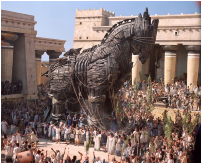
The Trojan Horse as a classic wartime deception ruse and hoax.