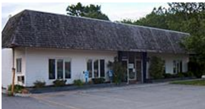
Offices of UCBB at Bath/Brunswick, the first location of MSC in 2000.