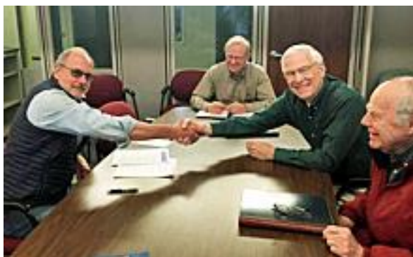
Closing the deal on the MSC Brunswick Landing building, 2018.

With a new move would come new expenses, especially a significantly higher monthly rent. In April 2018, the MSC board voted to establish a $35 membership fee, payable annually. It also set a fixed cost of sixty dollars for all courses regardless of the number of weeks per course. The annual luncheon would now carry a modest fee for all participants, ultimately $10. Fall registration income was about $17,000, spring income another $7,000. The board also voted to discontinue its longstanding policy of purchasing books for students, a policy that carried an annual cost to MSC of more than twenty thousand dollars. Even without paying faculty compensation, running a nonprofit college was not cheap.