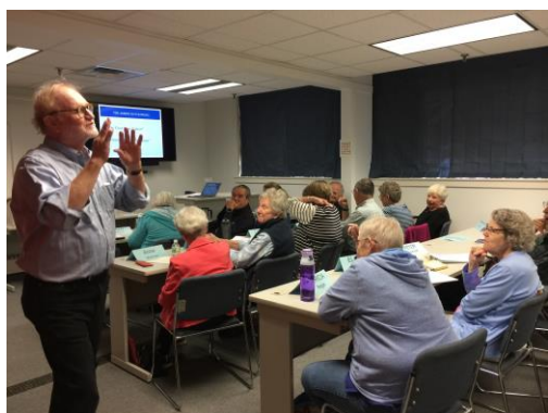
MSC class in action.

Computers play an increasing role at the college. Registration is mainly conducted on-line at home from student desktop or laptop computers. Faculty and students communicate by email. Classroom instruction utilizes interactive Whiteboards to view Power Point and other classroom technology; streaming to large-screen TVs is another option. The newsletter is increasingly an on-line publication with printed copies available on demand in the office. The calendar of events and meetings is also on-line. Committees depend on email. The college website receives an increasing number of hits and inquiries. Many of our students and faculty navigate the new world of Facebook, Google, and Twitter with ease.