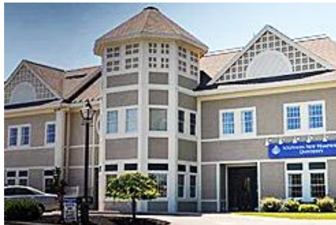
SNHU Building, MSC's home 2014-2018

The Board found the answer in the town of Brunswick, across the Androscoggin River from Topsham in the area known to the Wabenaki natives as Pejepscot. In June 2014, MSC moved to a new home at 10 Tibbets Drive in Brunswick. The college subleased classroom and office space on the second floor from the private Southern New Hampshire University (SNHU), which had provided a large number of technical courses suited to the denizens of BNAS. After the Naval Air Station closed its doors in May 2011, SNHU was glad to lease its classroom space to MSC during the day, while continuing to offer a reduced curriculum itself in the evenings.