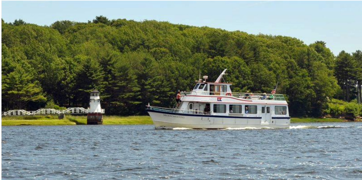
The Maine Maritime Museum in Bath with its teaching cruises on the Kennebec River offers continuing opportunities for MSC students.