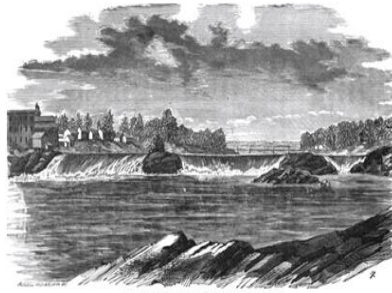
PEREPOINT FALLS, BRUNSWICK AND TUPHAM, ME. June 2020 Midcoast Inquirer