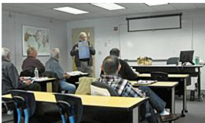
An MSC class in the former hospital building.