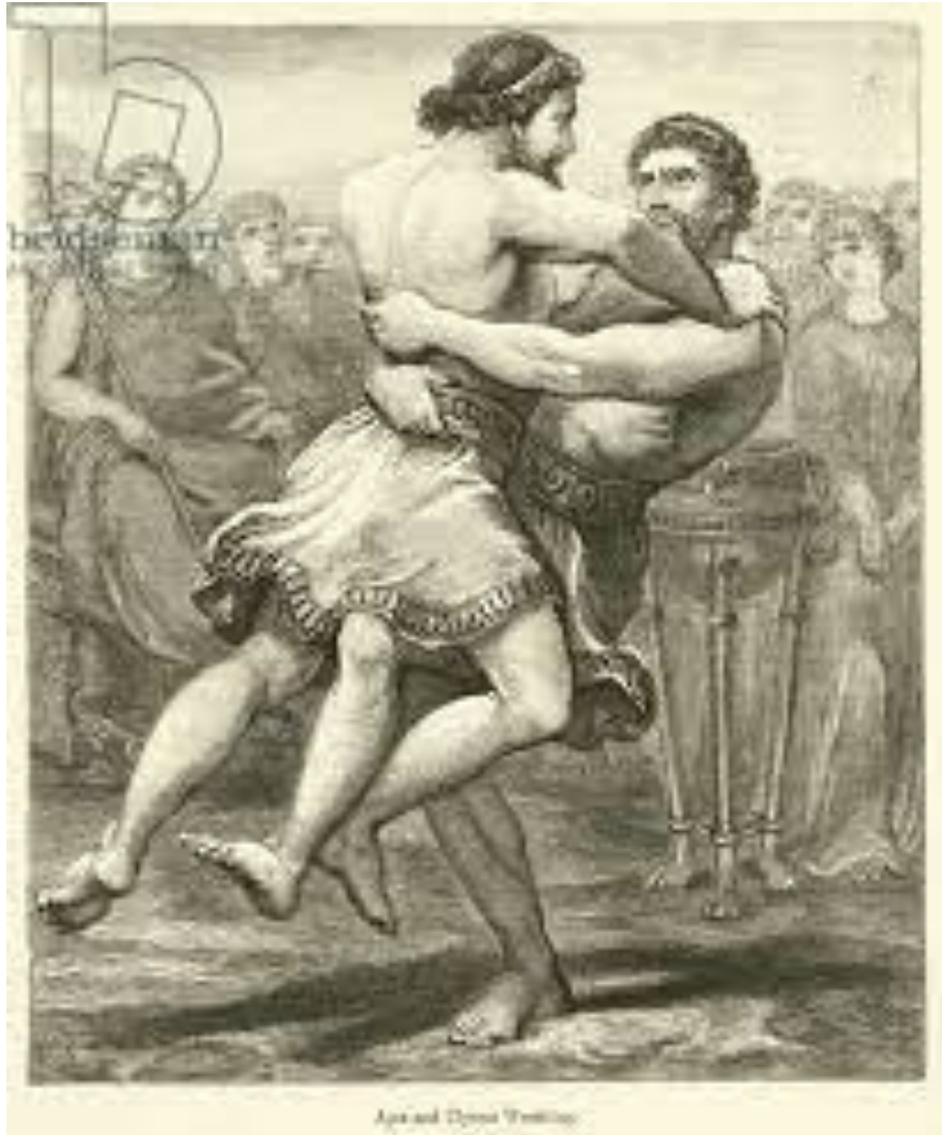
English Magazine, 1882