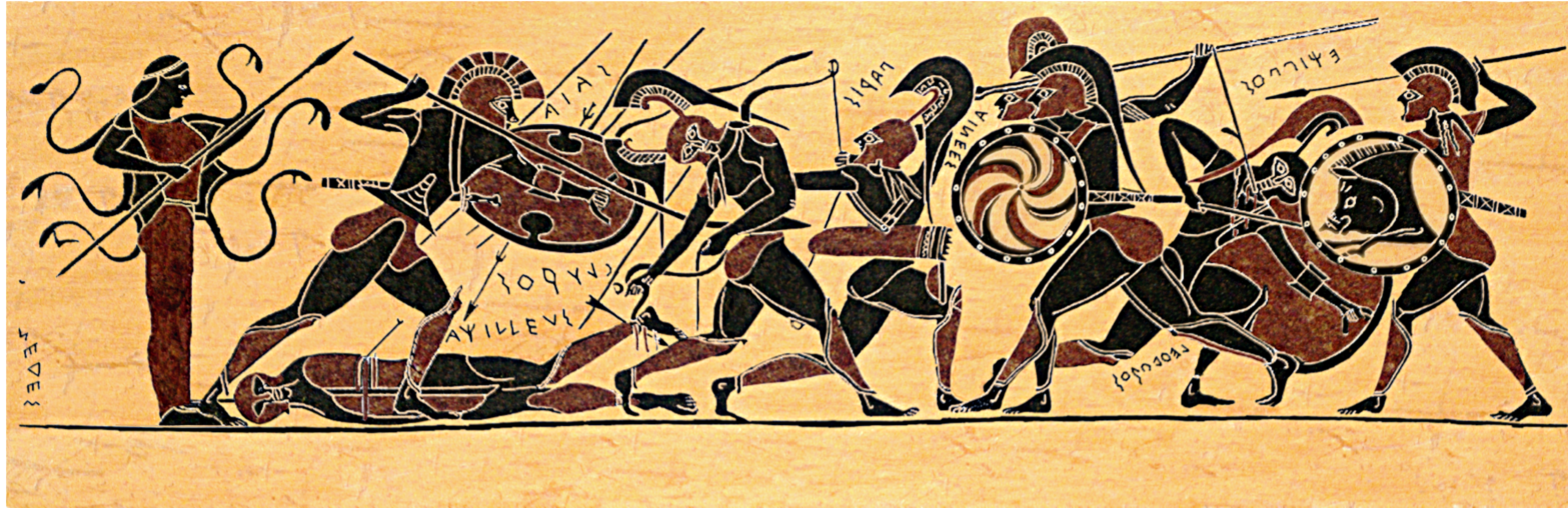
Modern Drawing made from Chalcidian Black-Figure Amphora from 540-530 BCE