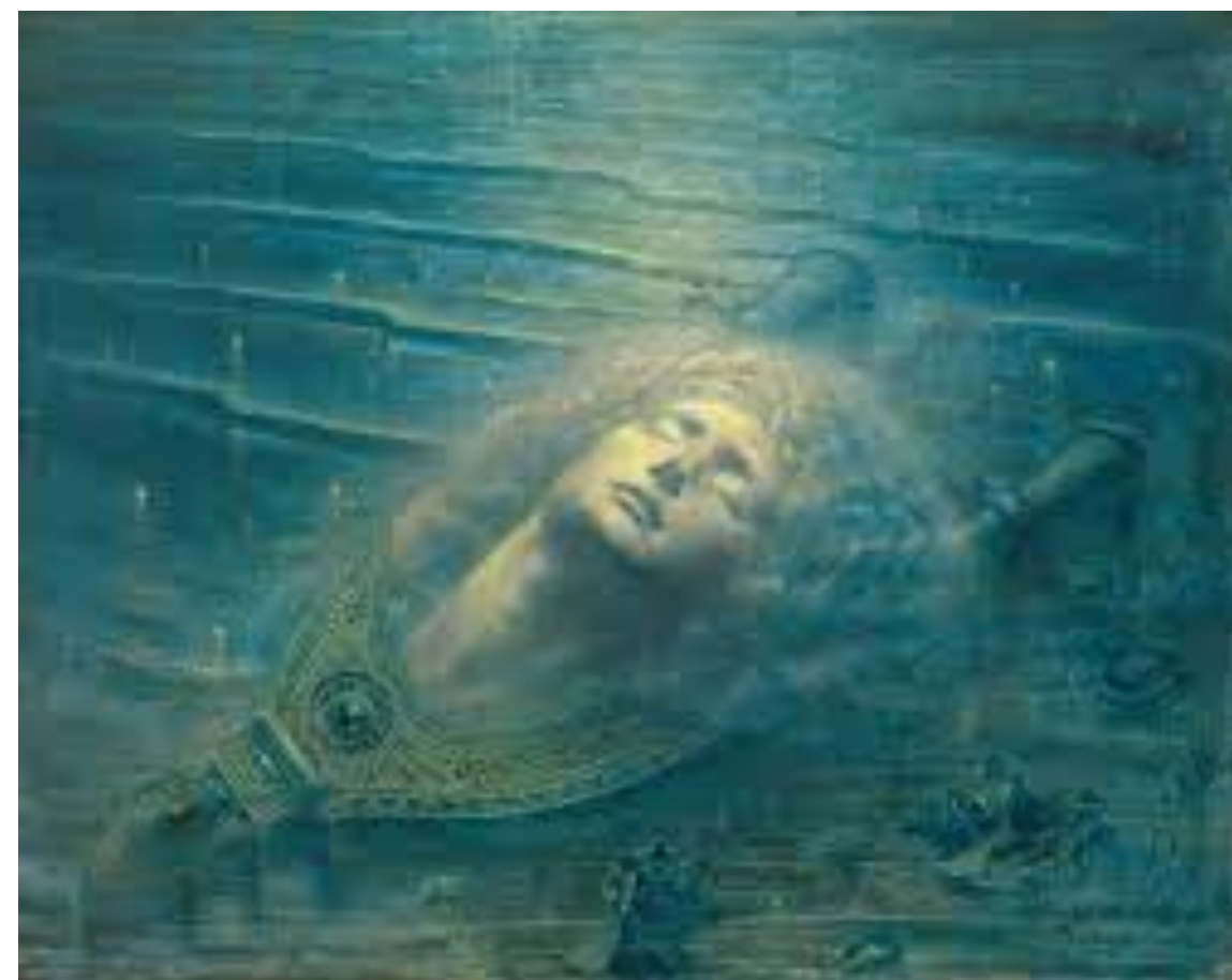
Jean Delville, 1893