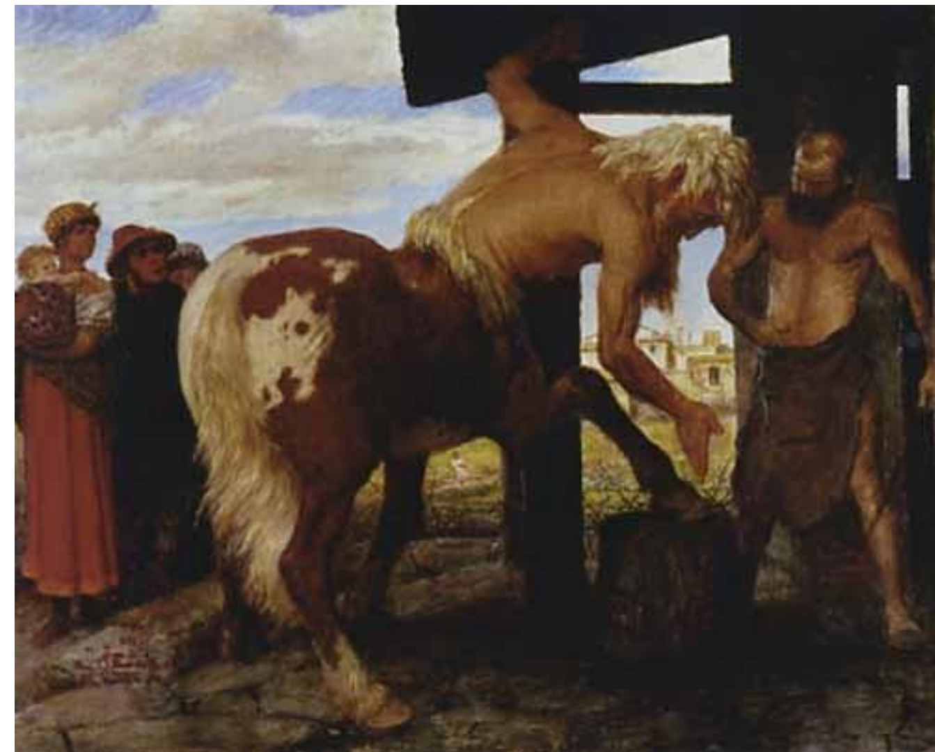
Centaur at the Village Smithy Arnold Böcklin, 1888