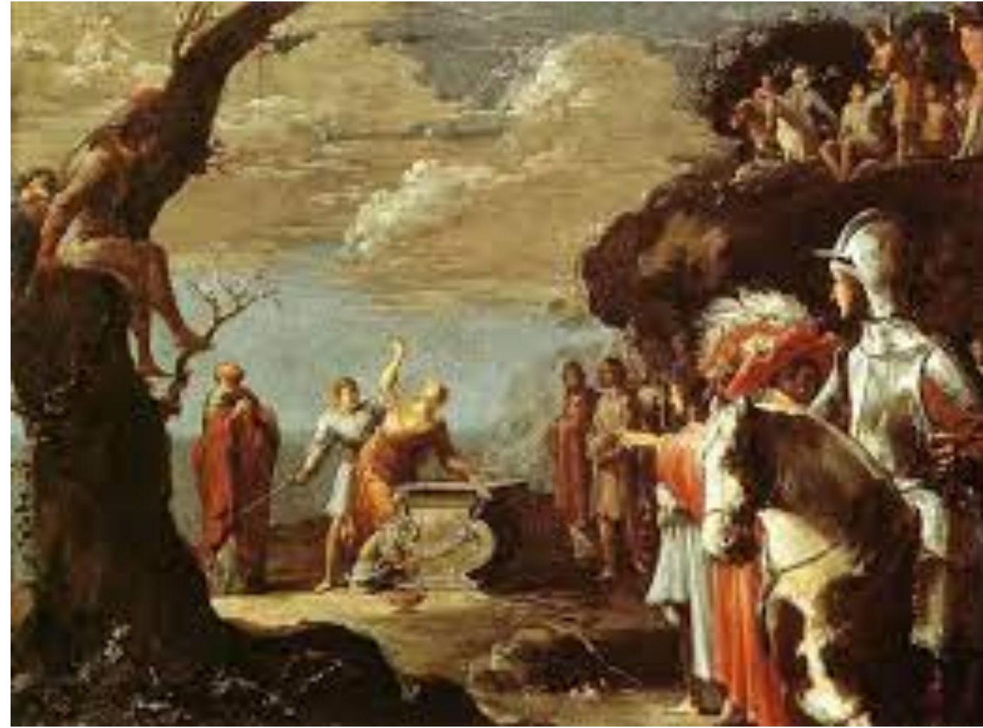
Leonaert Bramer (1596–1674)