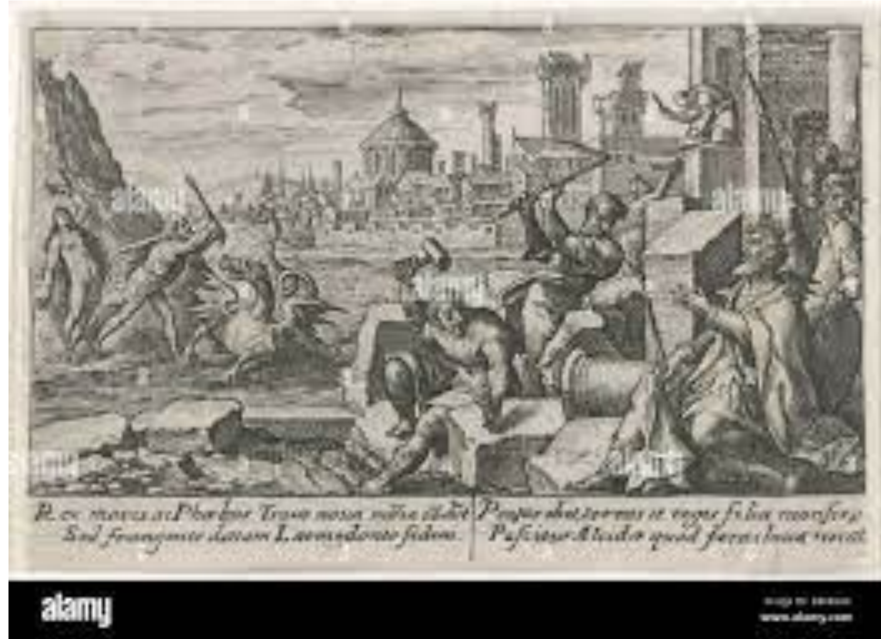
Crispian van de Passe 1613