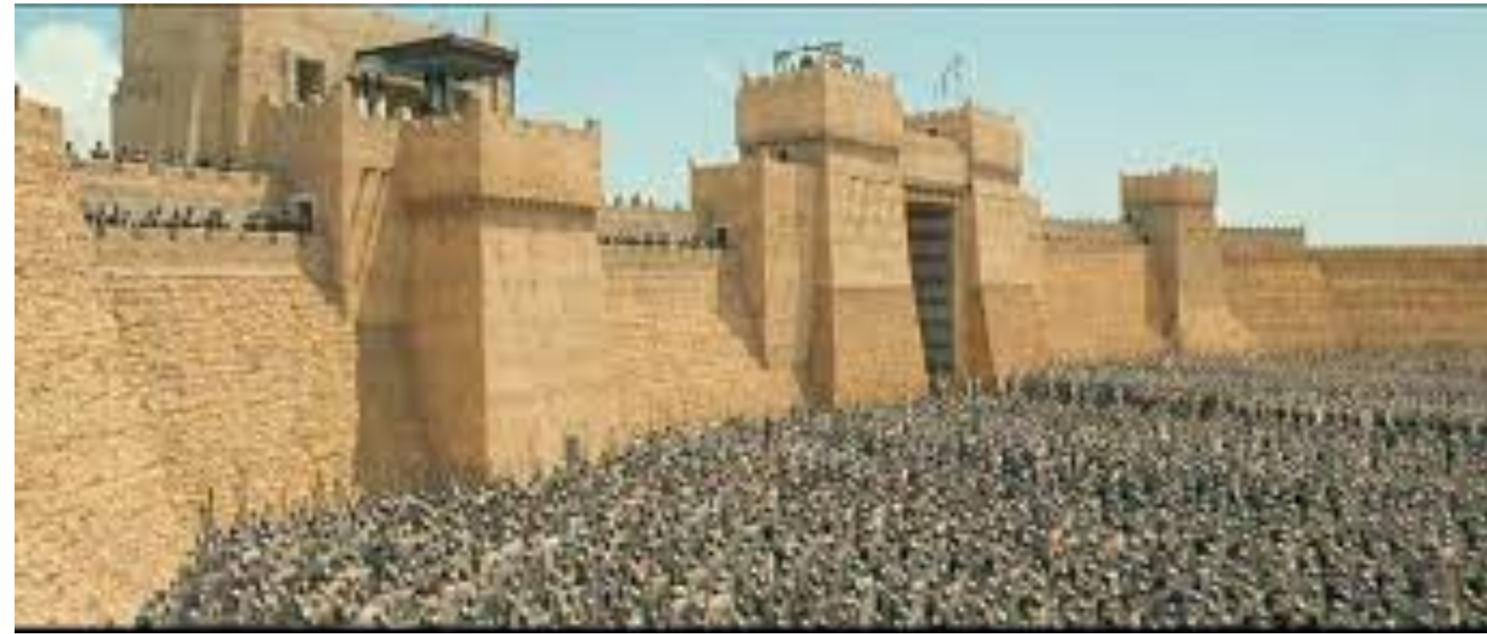
Walls of Troy c. 1200 BC