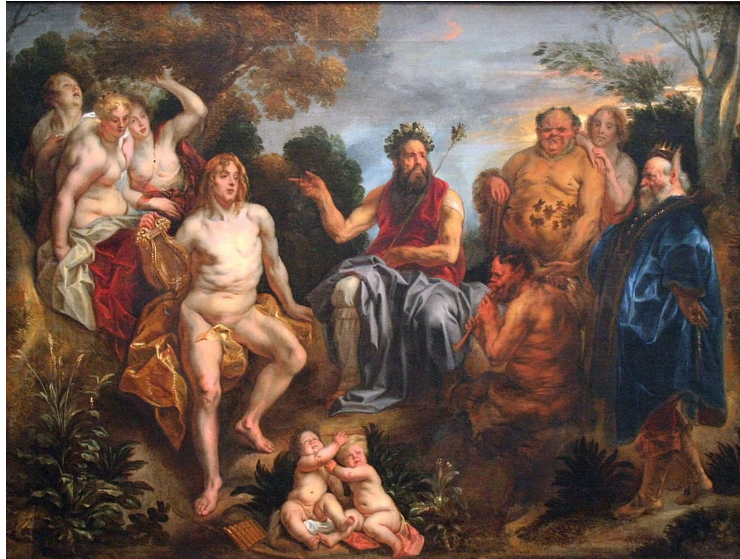
Jacob Jordaens (1593-1678)