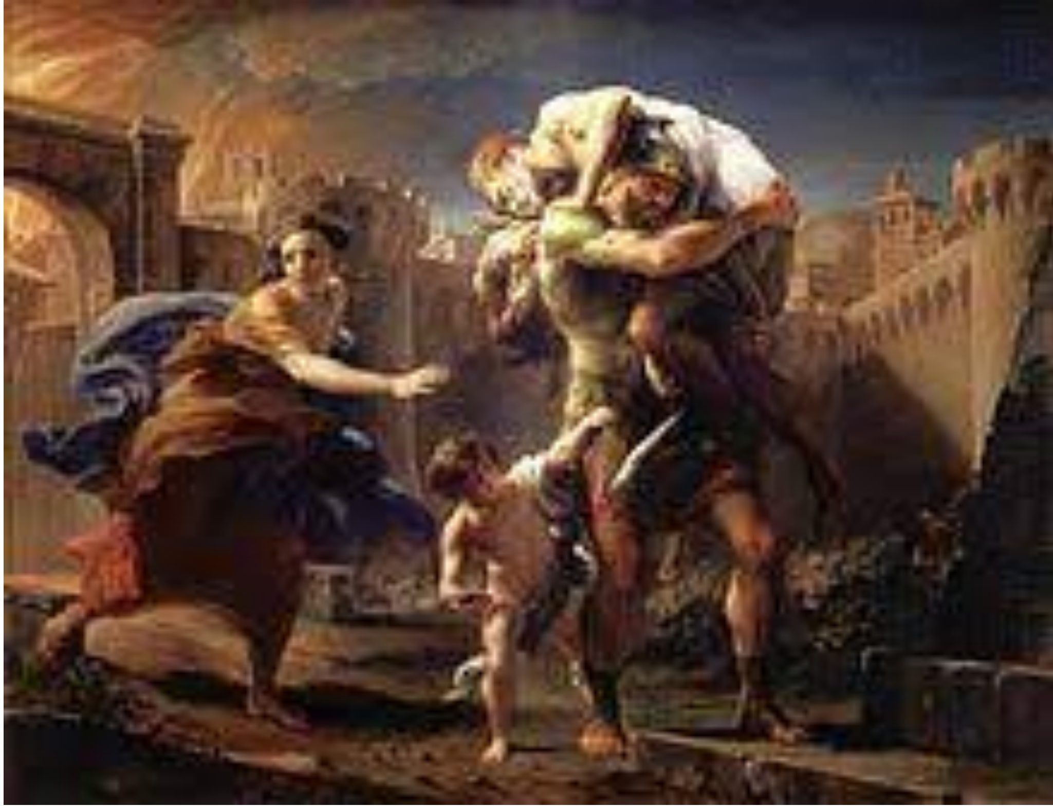
Federico Barocci, 1598