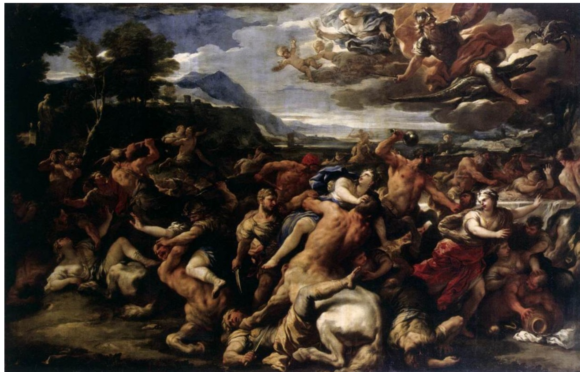
Luca Giordano (1634-1705)