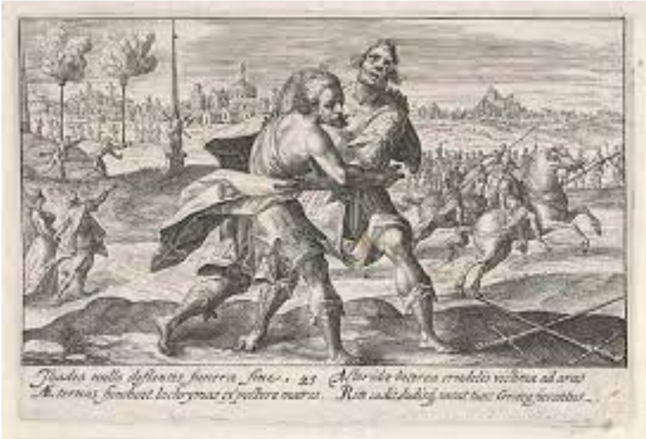
Crispijn van de Passe 1613