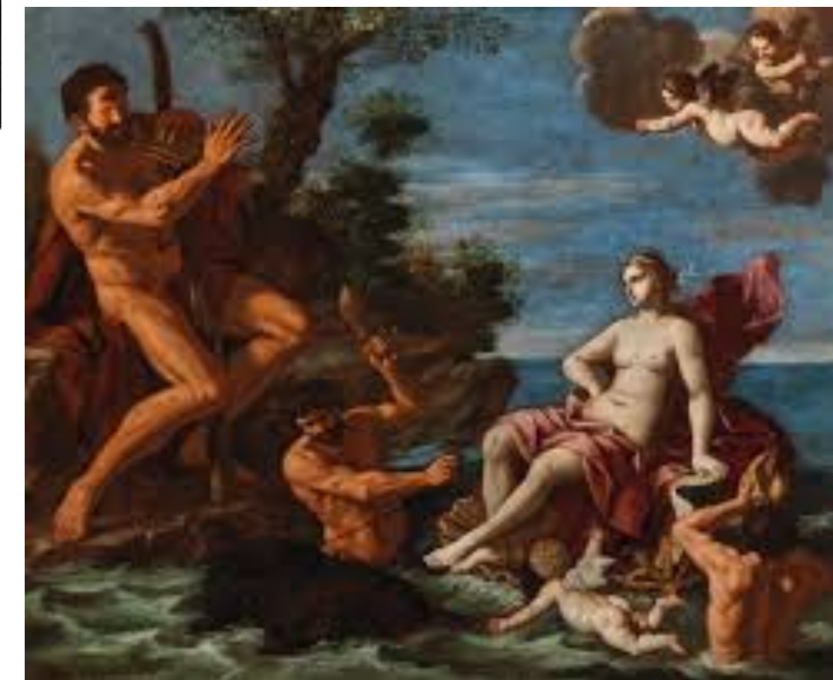
Giacinto Gimignani 1611-1681