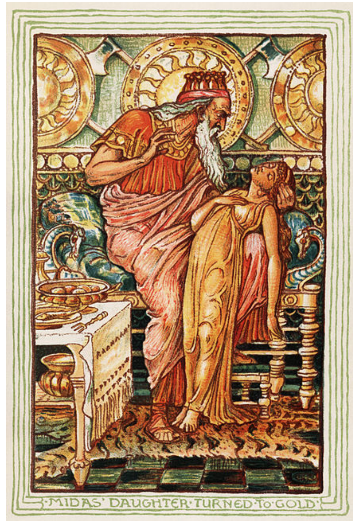
Walter Crane 1893