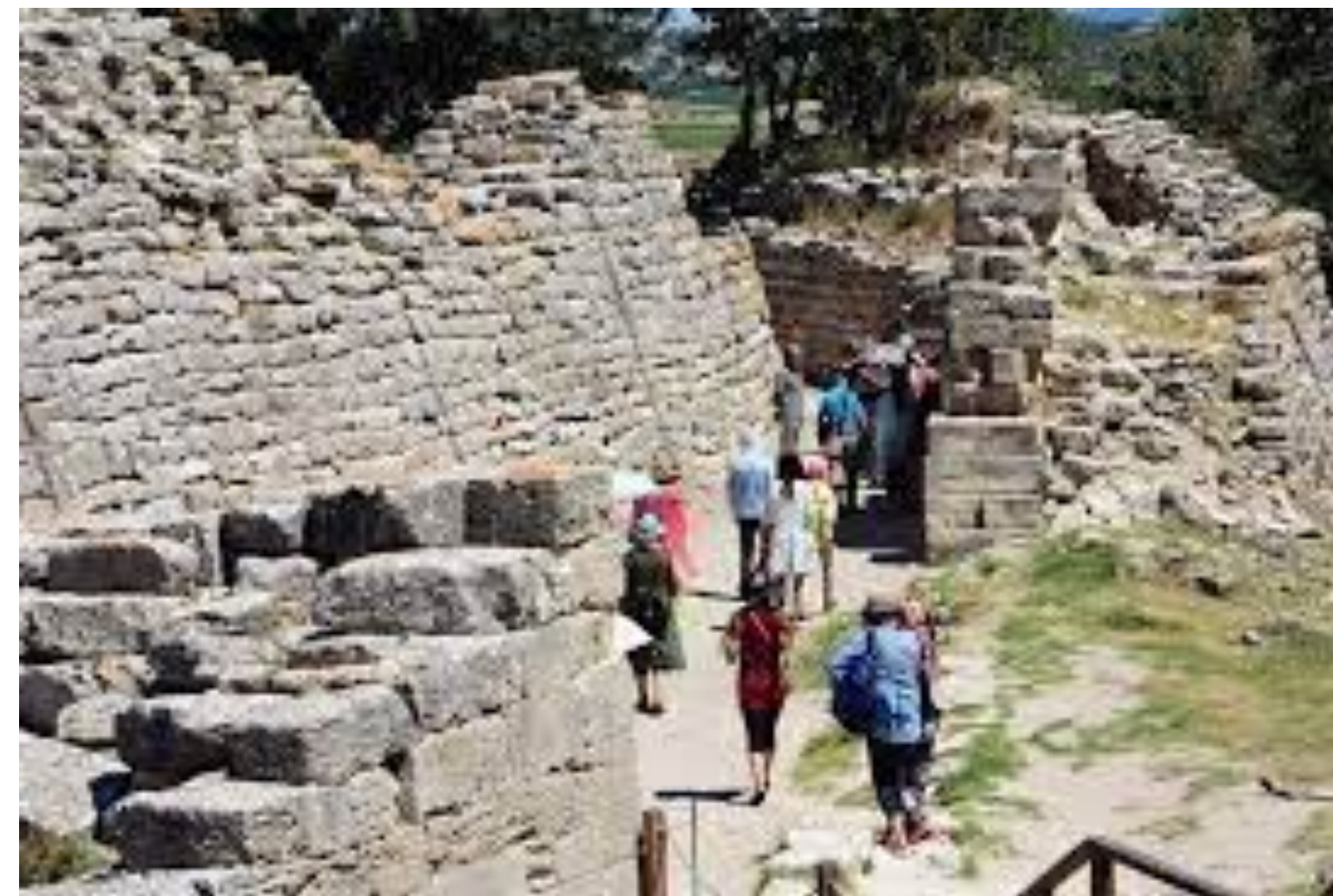
Walls of Troy c. 2021 AD