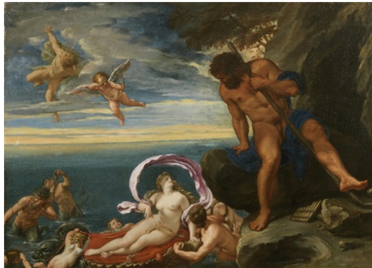
Bolognese School, 17th Century