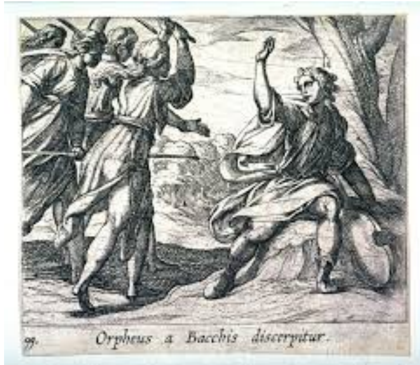
Antonio Tempesta 1606